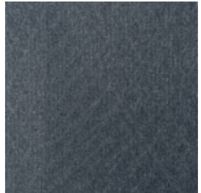
Transform - 76 Stone