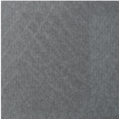
Transform - 74 Clay