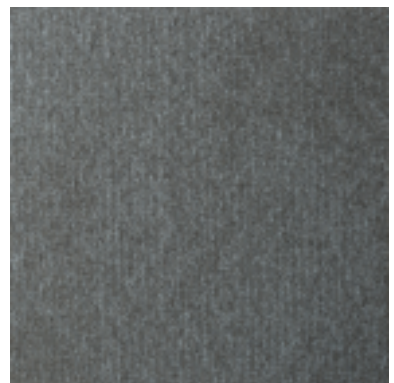
Transform - 73 Taupe