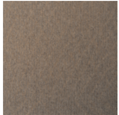
Transform - 64 Hemp