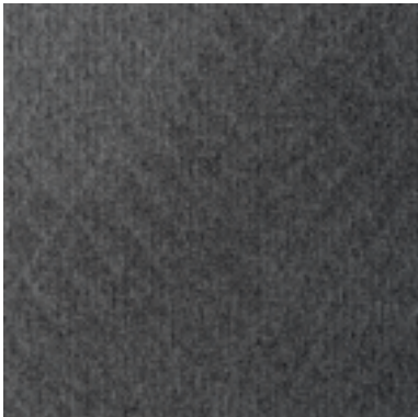
Transform - 75 Concrete