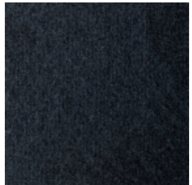
Transform - 78 Slate