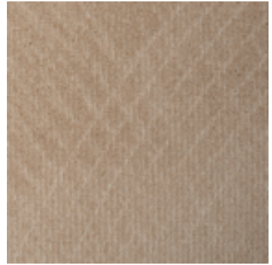
Transform - 62 Grain