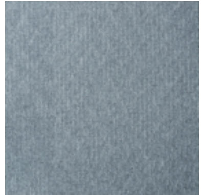
Transform - 72 Pewter