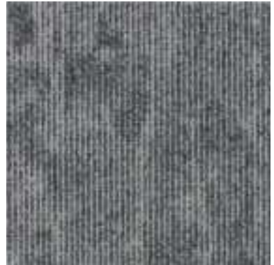
PAVE - 76 silver