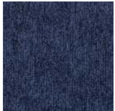
PAVE - 85 royal