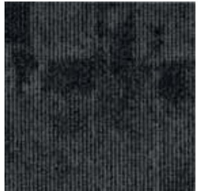
PAVE - 77 anthracite