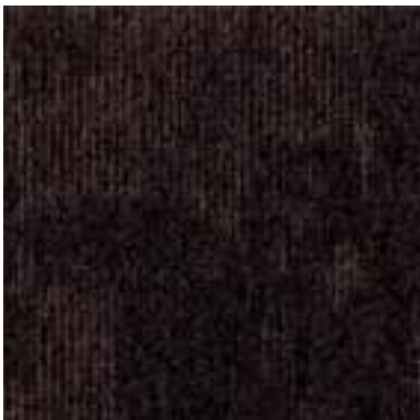
PAVE - 93 maroon