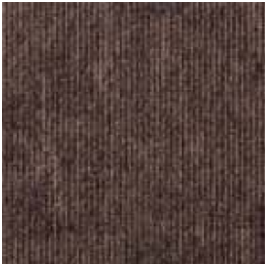
PAVE - 92 teak