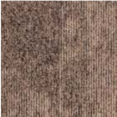
PAVE - 91 linen