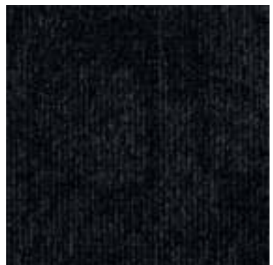
PAVE - 78 black