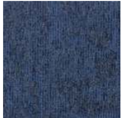
PAVE - 83 sea